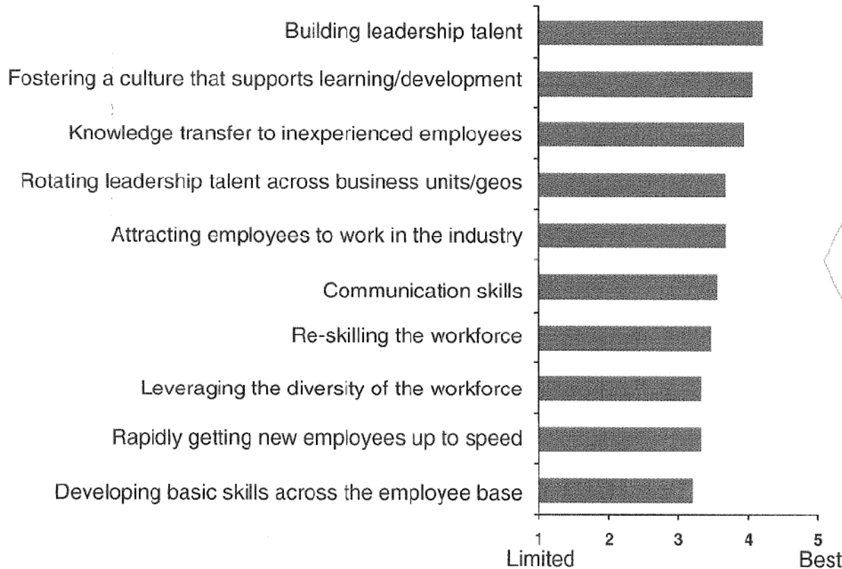
Primary Capability Challenges Facing the Industry between 2008 and 2020

A multiplex workforce enables the diversity of skills and culture, and unites them into common goals and direction